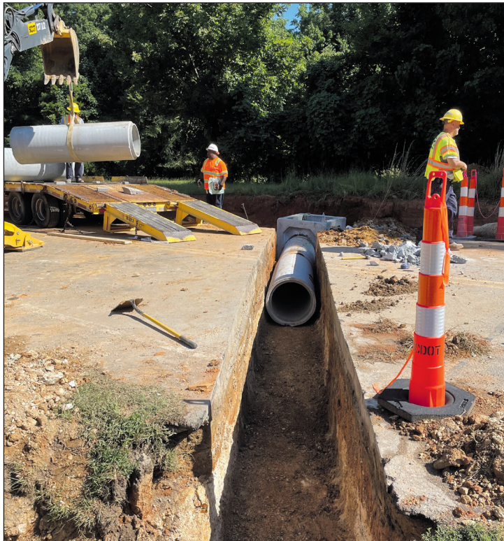
Lexington Maintenance crews install a 24-inch concrete pipe to alleviate a flooding issue on Calks Ferry Road.

Lexington Maintenance scheduled this work to be completed before school started back. They had some setbacks the first week due to rock and utility conflicts. The crossline location was moved a little further up the hill and once utility locations were marked, the crew began work on cutting the road and digging the ditch. The roadway work was completed and the road was reopened on schedule. That same day, they experienced a torrential rainfall and the pipe worked exactly as planned. The crew also completed several problem areas in the vicinity since the road was closed.