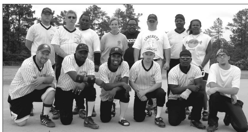
SUMTER / LEE MAINTENANCE