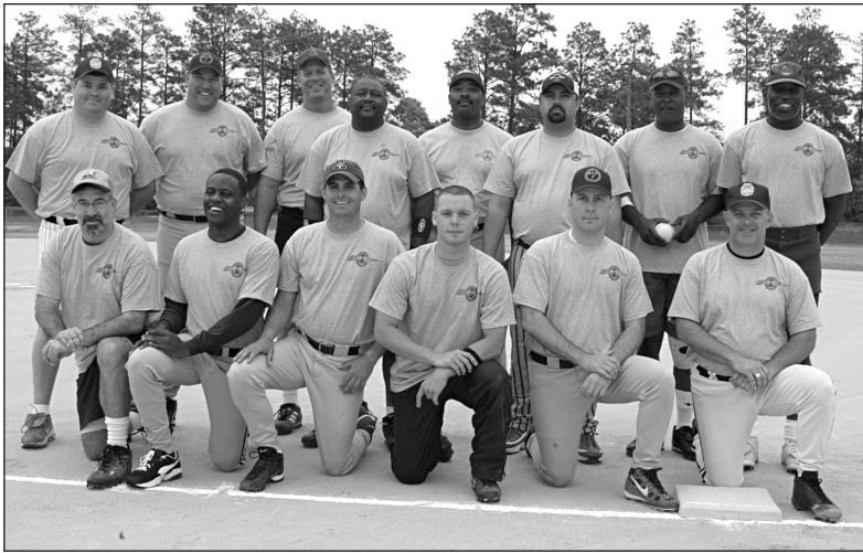
PATROL SUPPLY - 1st Place

APRIL 30, 2005 - OAK GROVE BALLPARK - LEXINGTON, SC