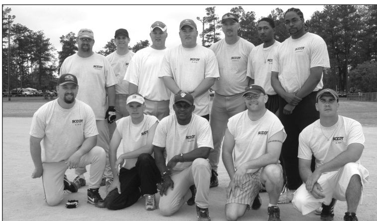
EDGEFIELD / McCORMICK / SALUDA MAINTENANCE