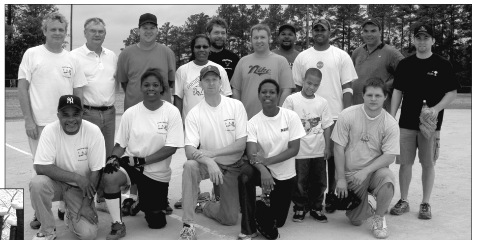
OFFICE OF MATERIALS AND RESEARCH