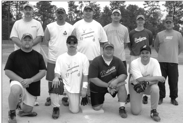
TRAFFIC & PLANNING