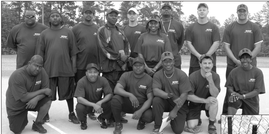
RICHLAND MAINTENANCE - 3rd Place