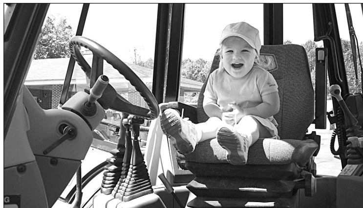
A little one takes the controls of a backhoe in Greenwood.