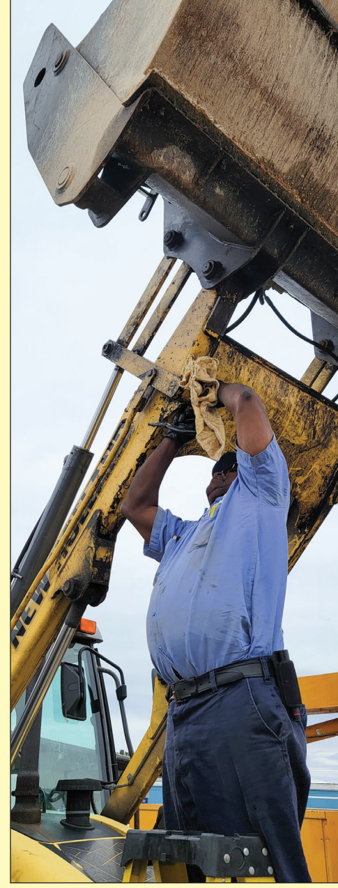
All equipment was inspected and ready before the storm hit.