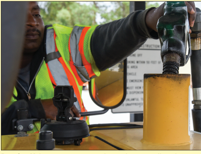
Beaufort Maintenance team member makes sure all equipment was full of fuel on Sept. 29 to ensure they were ready to deploy.