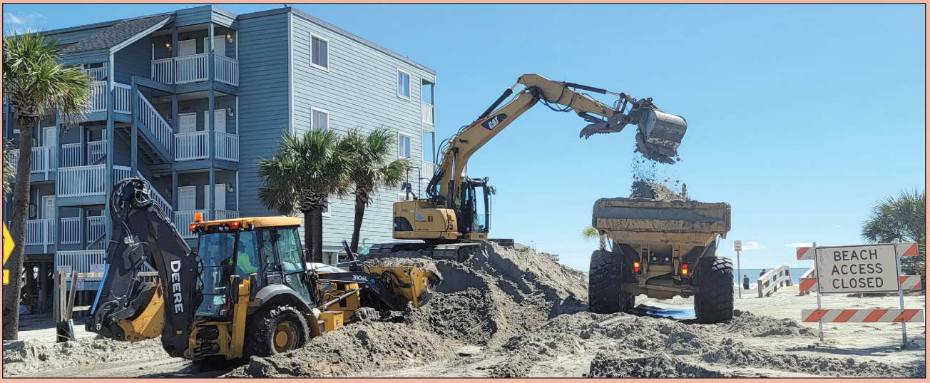
At Garden City, Horry County maintenance crews took the sand SCDOT removed from streets and placed it back on the beach to repair damage from the storm.