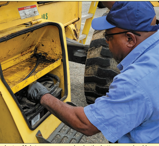
Charleston Maintenance crew checks the battery on a backhoe on Thursday, Sept. 29. The crews made sure all equipment was ready to go on Friday when the storm was expected to hit.

Dump trucks, backhoes, chainsaws and other equipment were loaded and ready to deploy at maintenance facilities along the South Carolina coast before Hurricane lan hit.