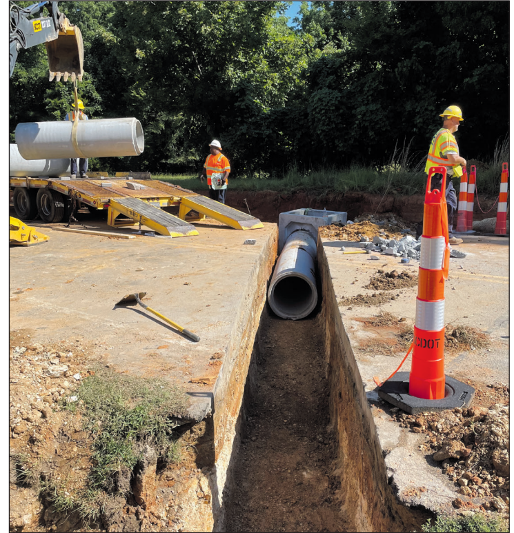
Lexington Maintenance crews install a 24-inch concrete pipe to alleviate a flooding issue on Calks Ferry Road.

Lexington Maintenance scheduled this work to be completed before school started back. They had some setbacks the first week due to rock and utility conflicts. The crossline location was moved a little further up the hill and once utility locations were marked, the crew began work on cutting the road and digging the ditch. The roadway work was completed and the road was reopened on schedule. That same day, they experienced a torrential rainfall and the pipe worked exactly as planned. The crew also completed several problem areas in the vicinity since the road was closed.