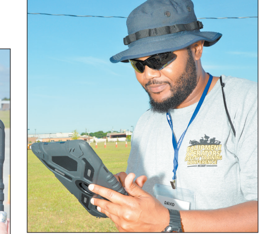
LEFT and ABOVE: This year, judges used iPads to score the competitors which improved accuracy and quickened scoring.