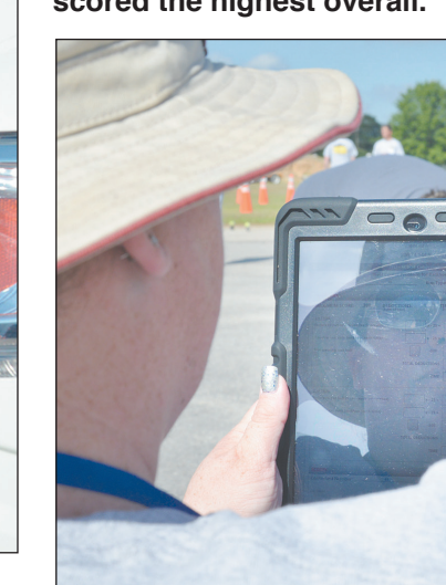
ABOVE: District 3 Committee scored the highest overall.