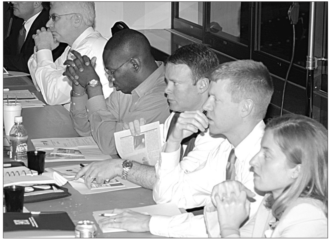
Employees watch the 'Statewide Transportation Challenges' video that explains the funding challenges in maintaining the state's road system.

For more information on how to join the Speakers Bureau or to schedule a speaker, contact the SCDOT Community Relations Office at 803-737-3935.