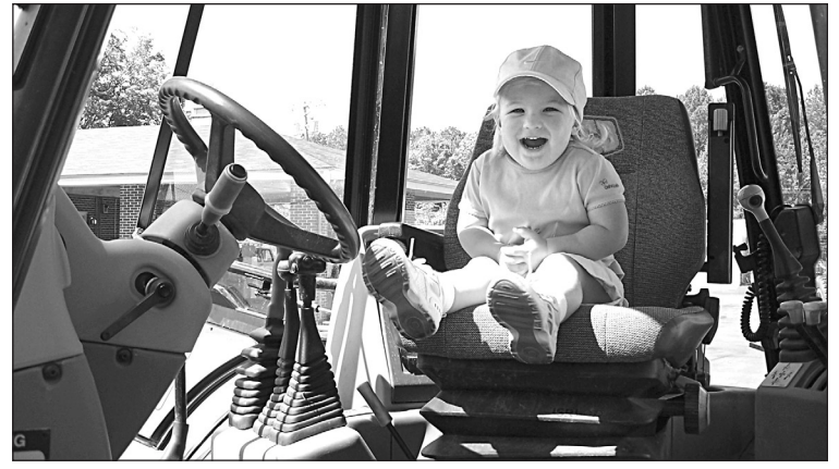
A little one takes the controls of a backhoe in Greenwood.