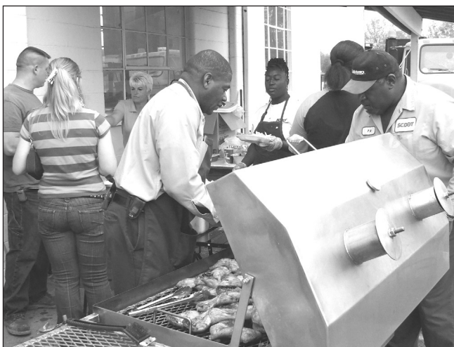
Colleton Maintenance served up a great chicken and fish lunch for Community Health Charities.