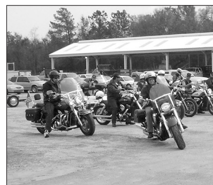
Specialized Bridge Division held a motorcycle run for Community Health Charities and raised more than $260.