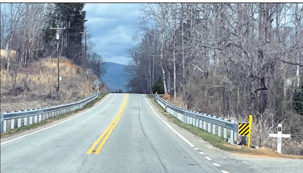
The Rural Road Safety project includes guardrail installation in areas to meet safety specifications on a mountainous road to protect motorists.

Work on this nearly 10-mile stretch of roadway began earlier this year and is expected to be completed in the fall.