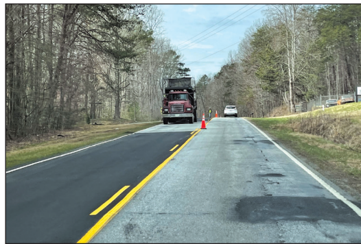
Contractors do full-depth patching along the roadway before repaving to prevent failure of the asphalt for years to come.