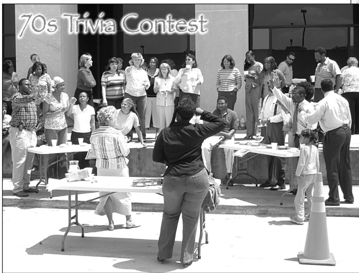
70s Trivia Contest