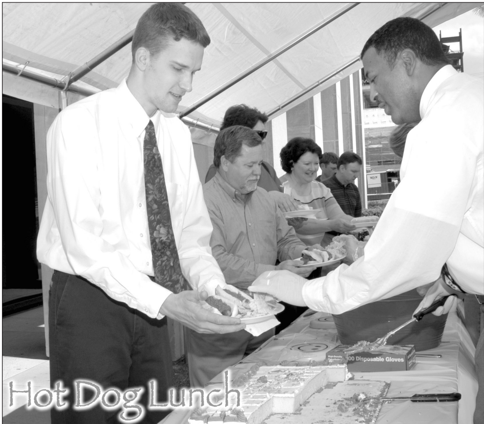
Hot Dog Lunch

On Wednesday, May 4, SCDOT Headquarters employees dusted off their platform shoes, found their old tie dyed T-shirts, leisure suits and enjoyed a free hot dog lunch served by the senior staff. A lot of employees who wore "retro-wear" had a good time with fellow employees during their lunch hour.