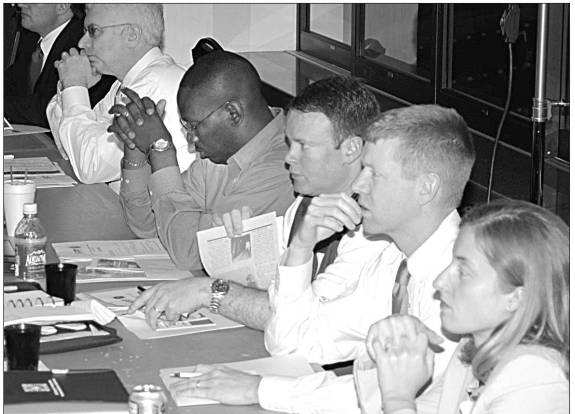
Employees watch the 'Statewide Transportation Challenges' video that explains the funding challenges in maintaining the state's road system.

For more information on how to join the Speakers Bureau or to schedule a speaker, contact the SCDOT Community Relations Office at 803-737-3935.