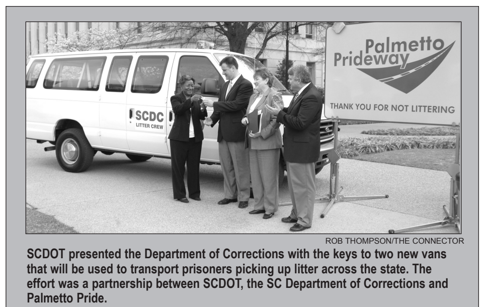
SCDOT presented the Department of Corrections with the keys to two new vans that will be used to transport prisoners picking up litter across the state. The effort was a partnership between SCDOT, the SC Department of Corrections and Palmetto Pride.