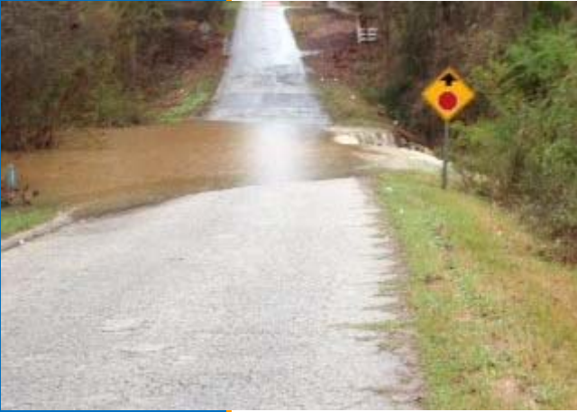
Herschel Plyler Road in Lancaster County was closed on December 30th due to flooding.

221 bridges were impacted by the flood waters. Of these bridges, 25 require full replacement as a result of the storm