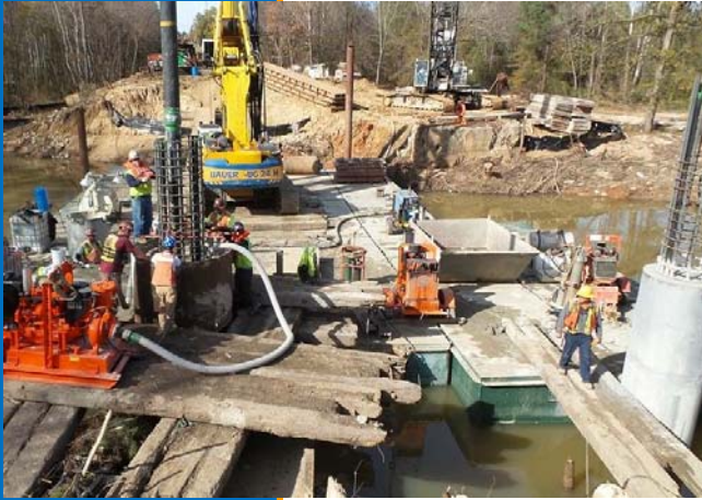
An SCDOT Bridge contractor is working to replace the US 176 bridge over Cannon's Creek in Newberry County. This bridge is scheduled to open by March 29, 2016.

As SCDOT completes the initial phases of flood recovery, our focus going forward will be on bridge replacements, major bridge repairs, or major culvert replacements.